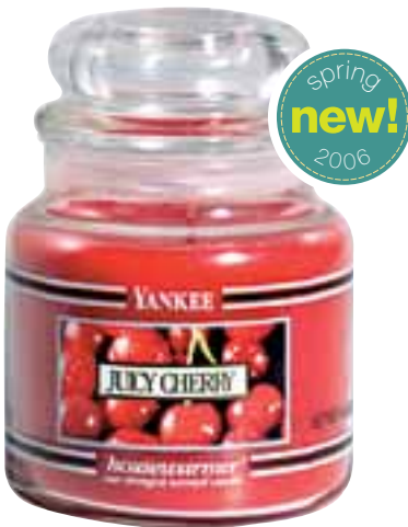
115 Juicy Cherry

Succulent, cool slices of ripe, sun-kissed melon delivered right from the farm.