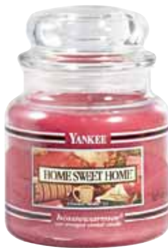
113 Home Sweet Home®

The exhilarating tartness of crisp green apples picked right from the tree.