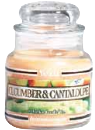
139 Cucumber & Cantaloupe

Irresistible! Deliciously rich, buttery frosting decadence ... like having your cake and eating it too.