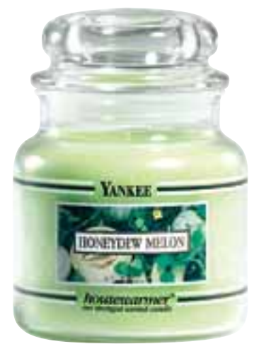
114 Honeydew Melon

Come home again with the heartwarming aroma of cozy, cinnamon-sweet potpourri.