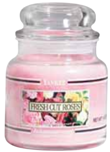
111 Fresh Cut Roses

A scrumptious confectionary delight, soft and sweet like rich cream.