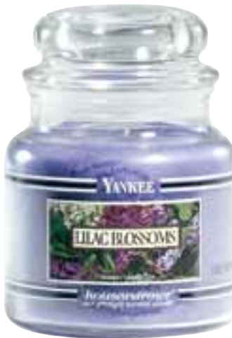
116 Lilac Blossoms

This electrifying scent of plump, wild cherries is brimming with natural tangy sweetness.