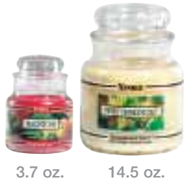
3.7 oz. 14.5 oz.