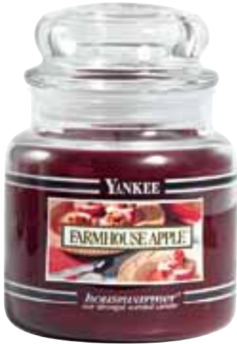
109 Farmhouse Apple™

The old-fashioned country goodness of tasty orchard apples sprinkled with spicy warmth.