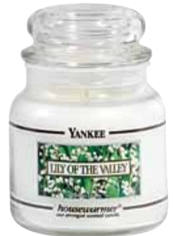
117 Lily of the Valley

Spring blooms eternal in the alluring fragrance of garden lilacs.