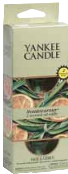
173 Sage & Citrus