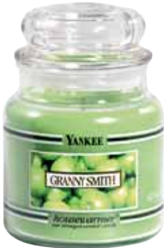
112 Granny Smith

The positively radiant aroma of fragrant garden roses clipped at the height of bloom.