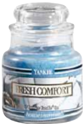
140 Fresh Comfort™

A taste of summer days, this garden-fresh combo is drenched with crisp, juicy brightness.