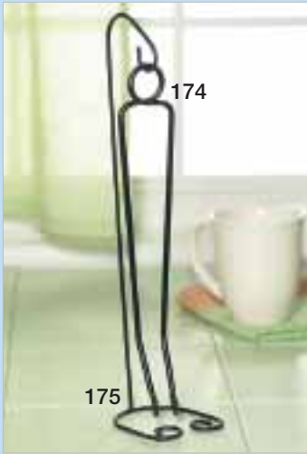
Candle Quencher™ and Candle Quencher™ Stand sold separately.

Everything you need to keep your candles burning bright.