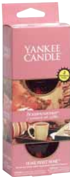
171 Home Sweet Home™