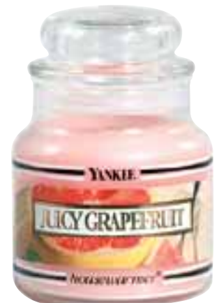
142 Juicy Grapefruit

So vividly real you can almost taste the unmistakable crunch.