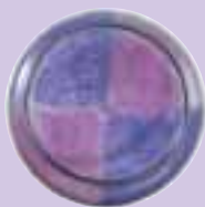
181 Lavender/Lilac Blossoms

Lavender/Lilac Blossoms 181 $22.00 Cucumber & Cantaloupe/Honeydew Melon 182 $22.00