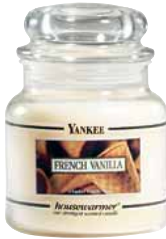
110 French Vanilla

The old-fashioned country goodness of tasty orchard apples sprinkled with spicy warmth.