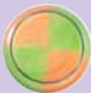
182 Cucumber & Cantaloupe/ Honeydew Melon