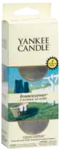
170 Clean Cotton™

Enjoy your favorite Yankee® scent in any room, anytime!